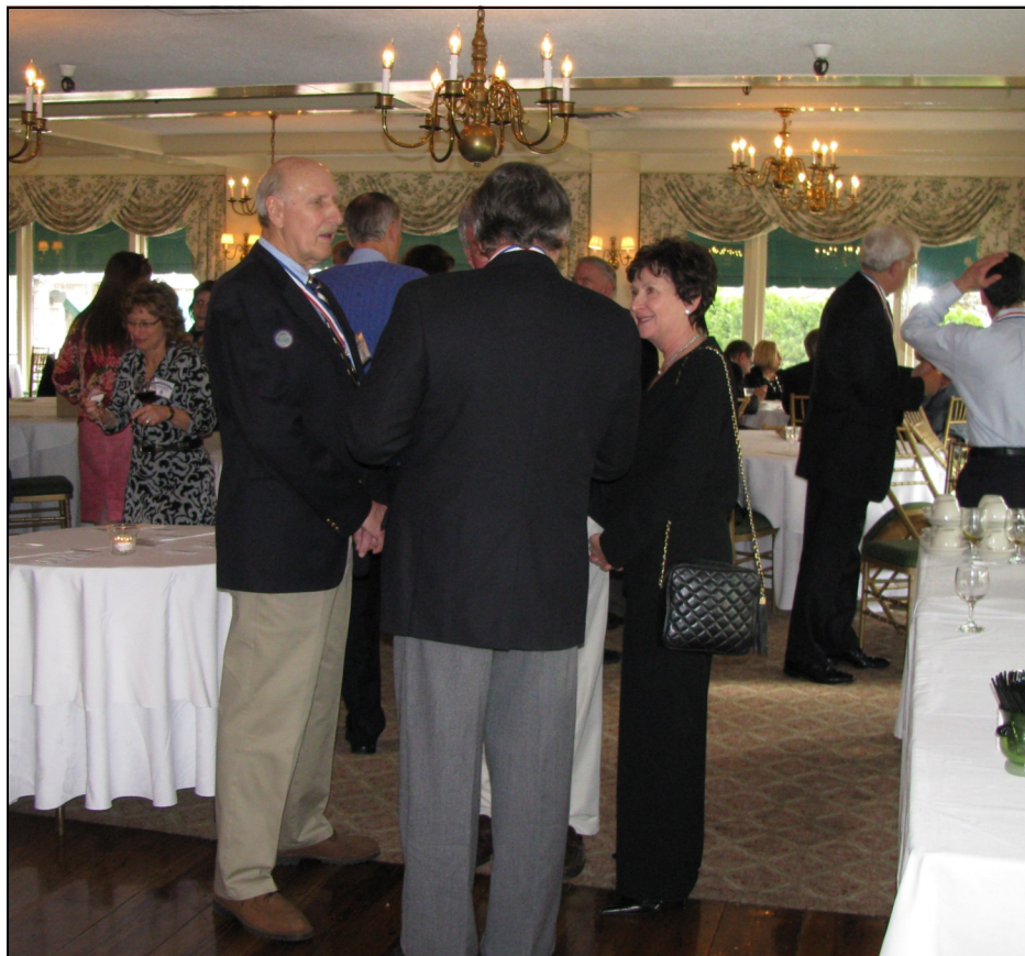
Obligatory crowd shot.