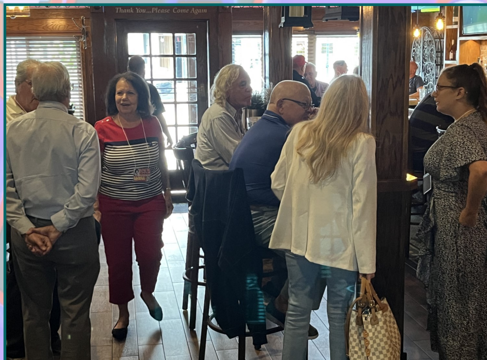
(Above) Random-slash-obligatory crowd shot.