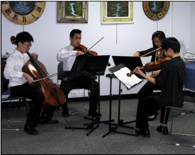
(Above) Young JHS musicians entertain the hungry masses with a string-quartet rendition of Black Sabbath's Paranoid album in its entirety. Righteous!