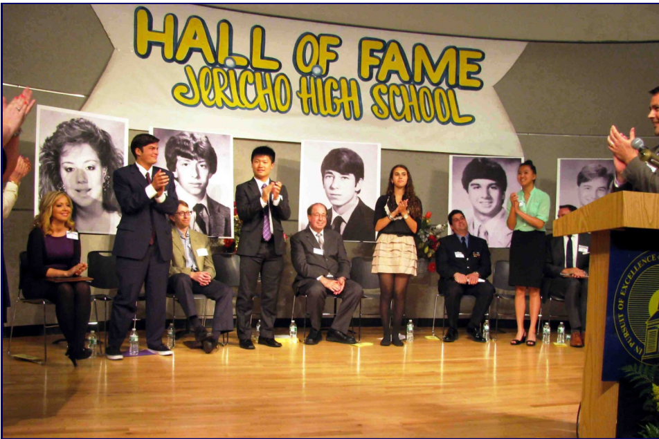
A final round of applause, and the twenty-fifth Hall of Fame ceremony is in the books.