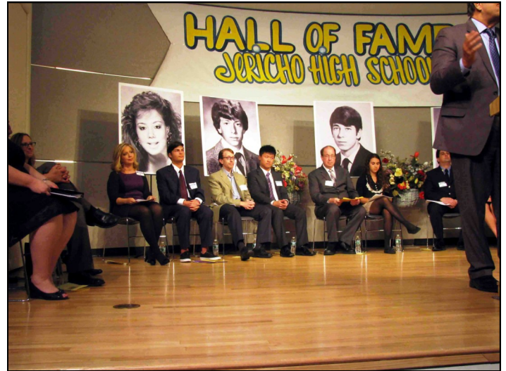
Induction into the Hall of Fame comes at a price: having to sit below a 2'x3' blowup of your high school yearbook photo, which usually serves as a museum exhibit of godawful hair-styles. This year, however, ranked low on the bad-hair score: no Oscar Gamble 'fros, perms gone haywire, or anything like that. It happens.